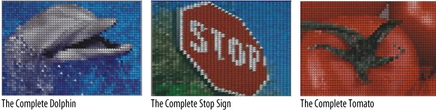
Figure 3. Puzzle set used in the experiment.

group completed the Stroop task before the NFT session. Second, before the experiment, the participants in the experimental group were instructed on how the NFT works and how they can maximize their performance by increasing the theta and decreasing the SMR frequency component (Fishbein et al. 1990). The participants in the experimental group were required to complete two puzzles displayed on the computer screen while having NFT. While three types of puzzles were employed throughout the whole experiment, randomly two of these puzzles were presented in a single session. Therefore, different puzzles were employed for each session (see Figure 3). During this procedure, performance on the puzzles was based on participants' brain activity that was recorded from the Cz area. Similar to the study of Lubar et al. (1995), the NFT sessions took approximately 7-min for each puzzle depending on the performance of the participant. At the end of each NFT session, the participants in the experimental group completed the Stroop task immediately. Finally, participants were debriefed and were asked to describe how they felt about their NFT performance.